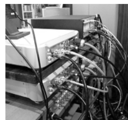
ESOTERIC MEXCEL cables used for power and all component interconnections