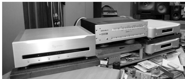
Rubidium master clock generator G-0Rb (left). A set of D/A mono-block converters D-01 (right).

The criterion of re-mastering is to faithfully capture the quality of the original master tapes. ESOTERIC's flag ship D/A converters, model D-01VU, Rubidium master clock generator model G-0Rb and ESOTERIC MEXCEL interconnect cables and power cords, were all used for this re-mastering session. This combination of highly advanced technology greatly contributed to capturing the high quality sound of the original master tapes.